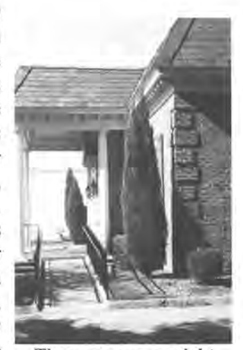
These narrow, upright junipers can be planted close to a building or fence for screening in a small area.

When selecting trees for screens, match the needed function to the mature shape of the tree. Choose trees with columnar or fastigiate forms (such as English oaks and European hornbeam) for narrow areas, row plantings, or against tall buildings. When planted in rows, trees with a narrow, columnar canopy effectively block an unsightly view, define areas, and act as a barrier. They can be planted close to fences and buildings without hanging over into other areas and can give a building formal or classical appearance.